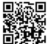
Registration & Payment